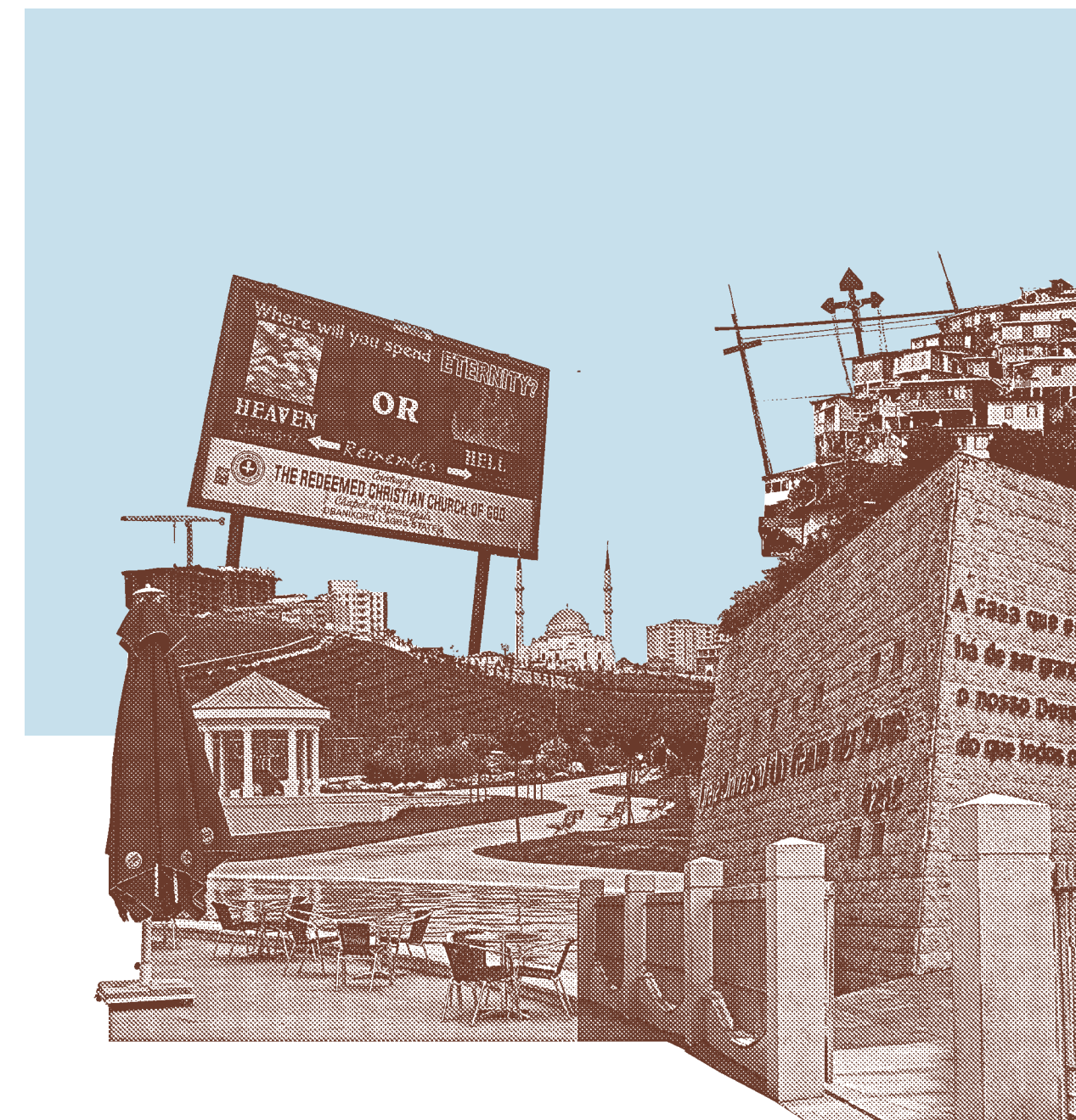
Europa-Universität Viadrina | Haus der Kulturen der Welt | metroZones – Center for Urban Affairs e.V. Forum Transregionale Studien | NGBK | Heinrich-Böll Stiftung | Goethe-Institute | Camera Austria